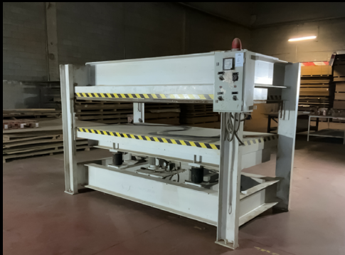
Tamai Ensidesa hot plate press