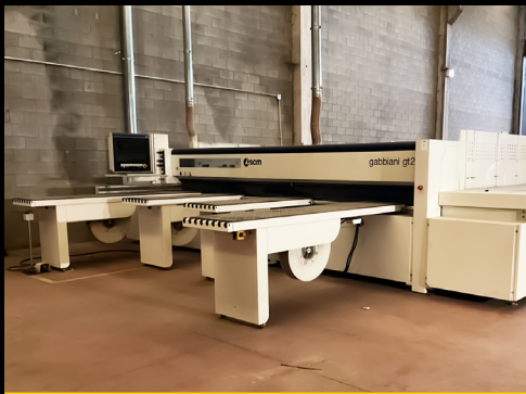
SCM Gabbiani GT2 115 automatic horizontal beam saw