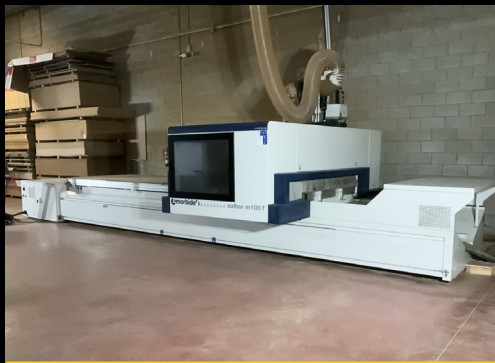
Morbidelli Author M100F 5-axis CNC machining center