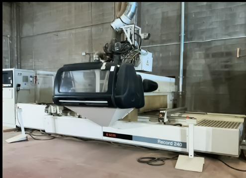
SCM Record 240 TV CNC Router 3-axis