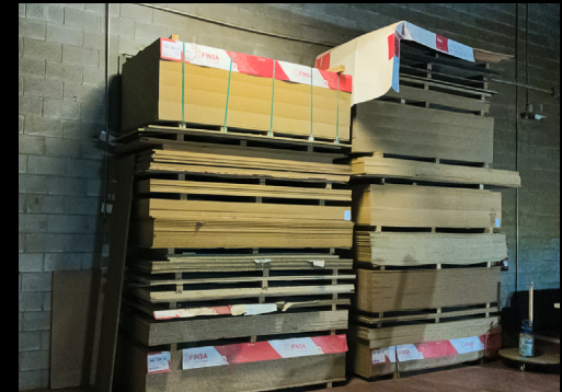
Large selection of wooden panels stock